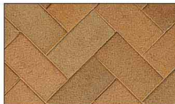
Harvest Buff Brindle