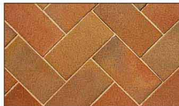
Hadley Red Brindle