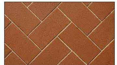
Hadley Red Mixture