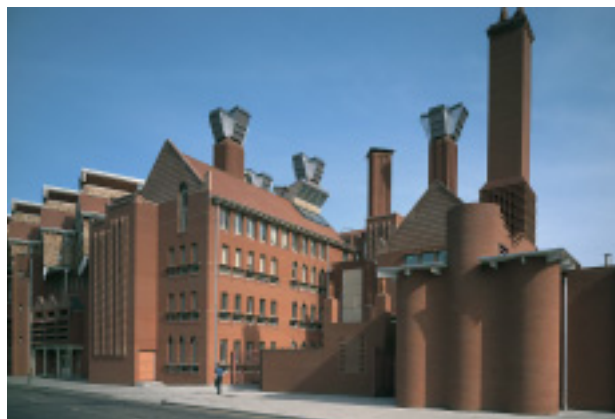
De Montfort University, Leicester