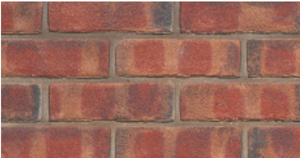
HEATHER RED BRINDLE