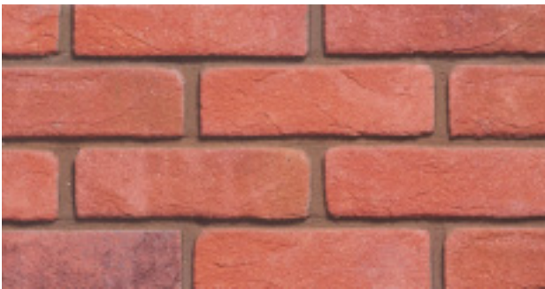
KINGSCLERE (with additional texture)