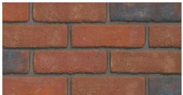
ASHFORD RED MULTI