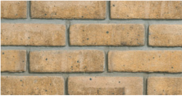
KENSINGTON YELLOW MULTI