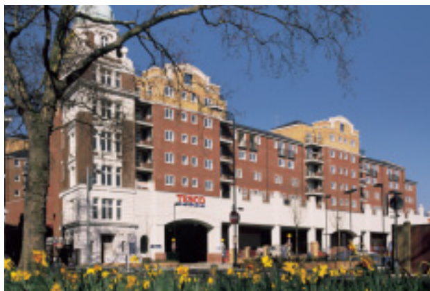
Osram Towers, Shepherds Bush, London