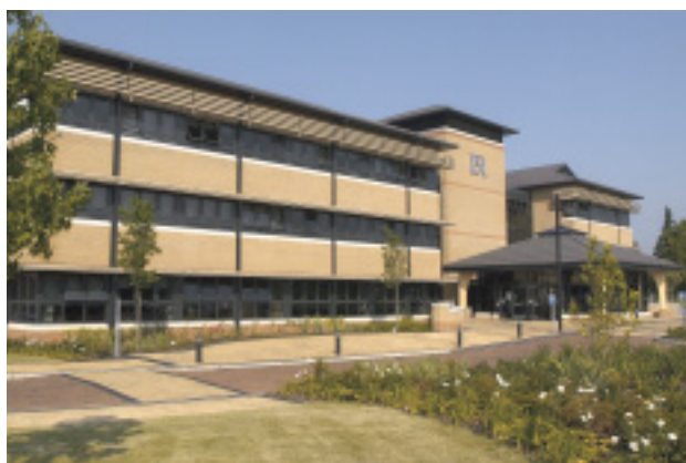
Land Registry, Tunbridge Wells