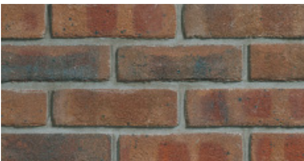
CRANBROOK MULTI RED